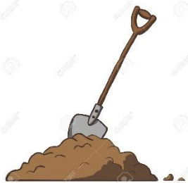
Dug a deep hole