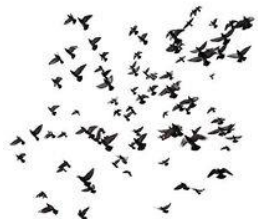
A hundred birds