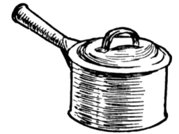
Pot of boiling water