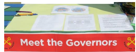
The Governors' stall at the Fair